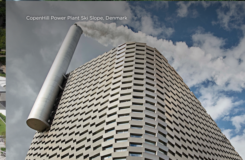
CopenHill Power Plant Ski Slope, Denmark