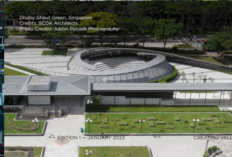
Dhoby Ghaut Green, Singapore Credits: SCDA Architects