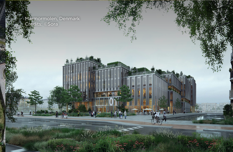
Marmormolen, Denmark