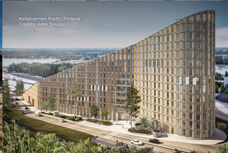
Keilaniemi Portti, Finland