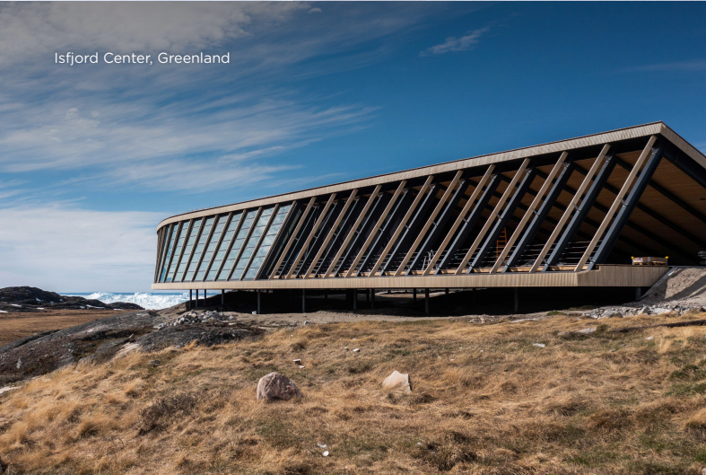
Isfjord Center, Greenland