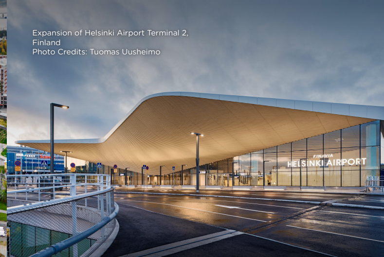
Expansion of Helsinki Airport Terminal 2, Finland