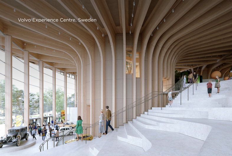
Volvo Experience Centre, Sweden