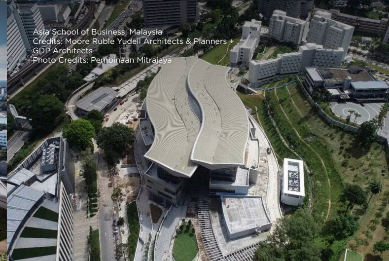
Asia School of Business, Malaysia