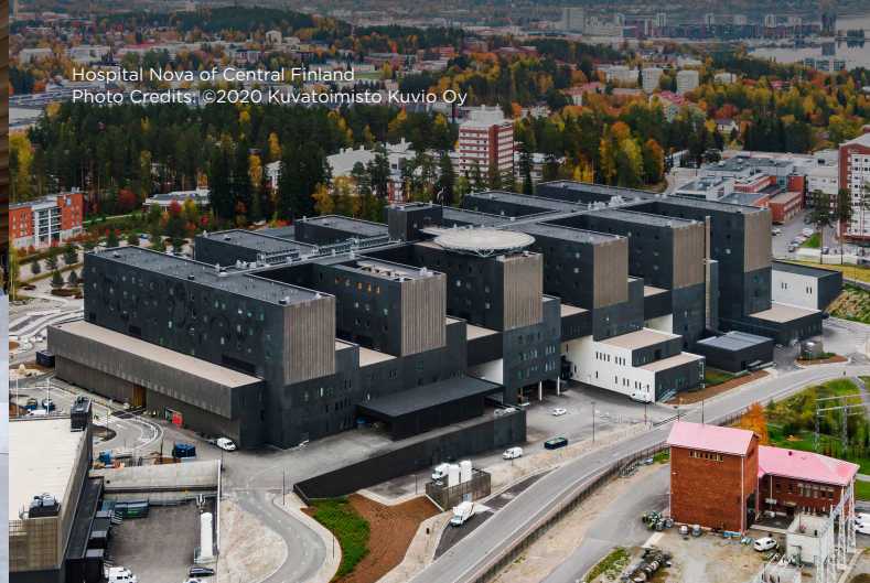
Hospital Nova of Central Finland