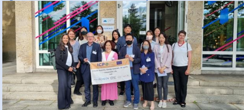
Figure 3. A snapshot of the first study visit in Berlin