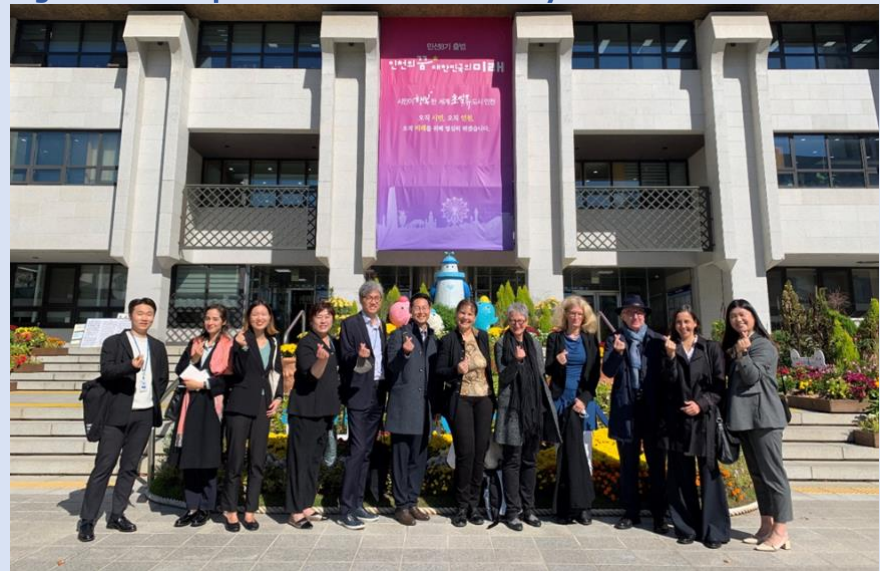
Figure 5. A snapshot of the second study visit in Incheon

From October 16 to 20, the delegation from Berlin visited Incheon as a second study visit between two cities. Under the theme of main two cooperation topics which are Smart City and Urban Regeneration, Berlin delegates visited many sites including Incheon Free Economic Zone Authority, Incheon Gongdan Fire Station, Ganghwa Urban Regeneration Site Support Center and Gaehangjang Open Port Area. During the visit, both cities confirmed that they want to continue their cooperation on both main topics in a deeper level. Berlin delegates expressed interest in signing MOU on the theme of Urban Regeneration and Smart City with detailed activity plans including technical visits and jointly hosting 2023 Smart city International Symposium and Berlin-Asia Pacific Week session.